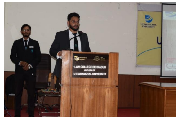
The Legal Aid Centre in collaboration with Aarambh – The Debating Society,